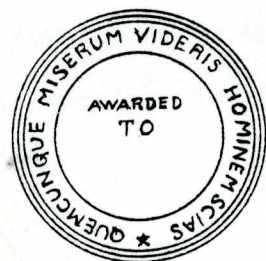
Bronze Medallion Second Design 1904 - about 1914