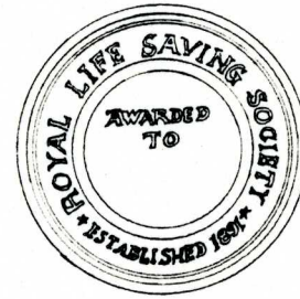
Bronze Medallion Sixth Design